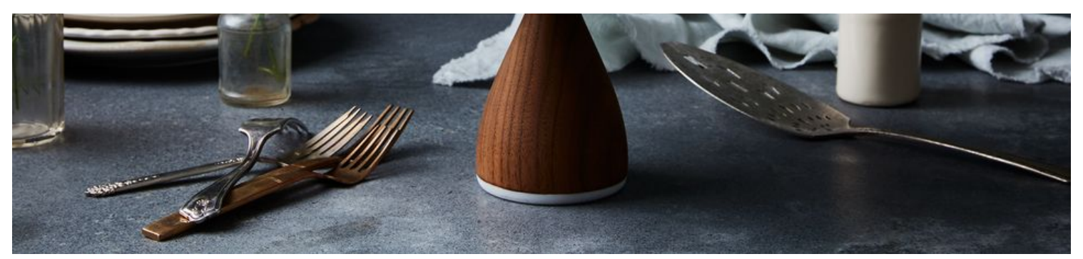
My 34th birthday cake.

I also baked as a form of meditation, like the yoga I found myself in three times a week. I'm an instinctual baker, recognizing the feel of a batter or the crumble of a dough, which is helpful because I had to be friend an entirely new pantry of ingredients that defied my classic culinary training. I went to work on developing a cake recipe that I hoped to use for my next birthday, as if I could create hope with my hands. Baking is proof that the combination of disparate things, when working together in the right amounts, make something altogether new. I have come to think of the concept of health in regard to lifestyle somewhat the same way.